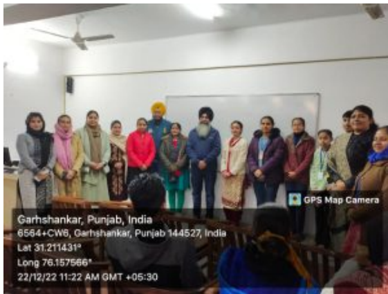
Winners of Poster Presentation