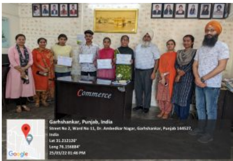
Certificates were issued to the students who participated in