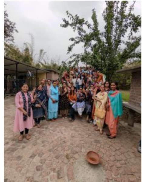
Students at Barota Farm Tibba, Nangal