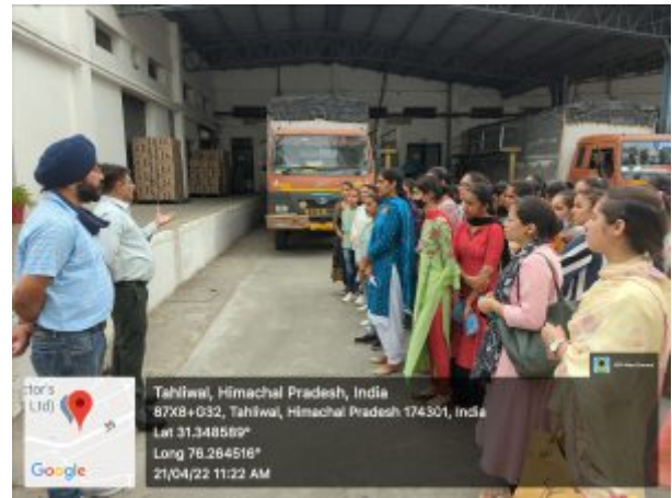
Students' interaction with the Plant Manager at Cremica