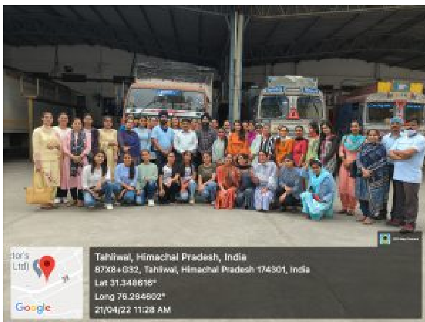
Group Photo at Cremica